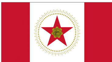
CURRENT BIRMINGHAM CITY FLAG

A flag can welcome, console, honor, unify.